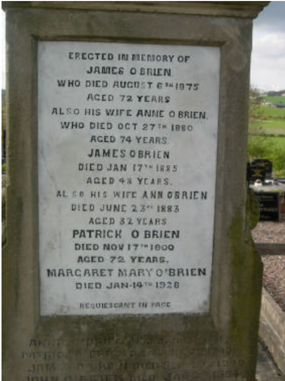
Closeup of bottom inscription: