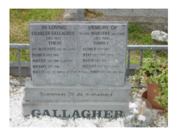
The Gallagher Family // Murlog

[translation: The peace of God to their souls]